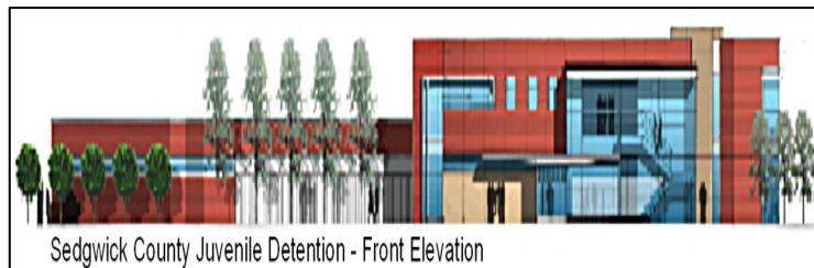
Sedgwick County Juvenile Detention - Front Elevation

In March 2002, Sedgwick County began the process of planning for a new Juvenile Court and Detention Facility. The Sedgwick County Juvenile Courts and Detention Facility replaces an outdated 30-bed detention center and attached courts facility. Since the early 1990s, the Sedgwick County courts system has experienced an increasing caseload. Court calendars are jammed, public spaces and offices are congested, and more than 40 youth are held daily in out of county detention facilities to avoid severe crowding at the county detention center. Planning studies indicated continuing growth in court and detention operations in coming years. In response, county authorities elected to pursue the development of a new detention facility and expanded court space.